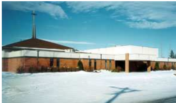
Waldheim Mennonite Brethren Church

Waldheim is also unique in that within this small town, there are three churches serving the community; Waldheim Mennonite Brethren Church, Salem Church and Zoar Mennonite Church. Although each church is unique, they work together to coordinate Easter Services, Christmas Services and weekly/bi-weekly programs such as Boys Brigade and Gems.