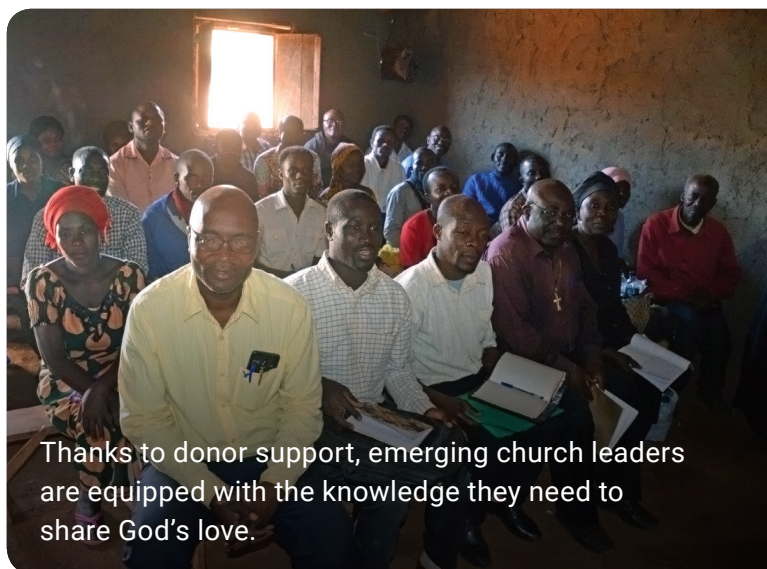
Thanks to donor support, emerging church leaders are equipped with the knowledge they need to share God's love.

Your gifts make it possible for ministry students to be educated and equipped to reach the world for Christ! You can support students by giving online at MBSEMINARY.CA/DONATE .