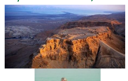
Day 9: Mon Mar 21, 2022